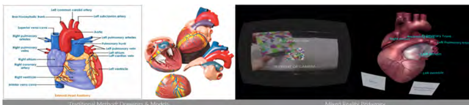
Figure 1. Pedagogies for teaching anatomy with a heart diagram/model

The case study for this paper will be a MR system integrating spatial learning analytics for facilitating the learning of anatomy by health science and medicine students through a visualisation of the human heart. An example of the relative traditional and MR pedagogies is shown in Figure 1.